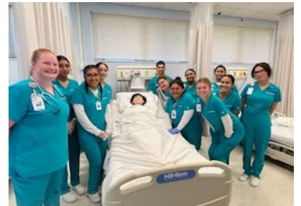
Career Dual Enrollment Online Request Form