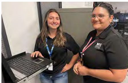
Career Dual Enrollment Online Request Form